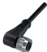
Plugs for connecting devices