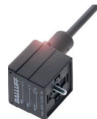
Valve connectors for connecting valves

The wiring effort is the greatest when directly connecting a device to the PLC. This is because each conductor in the cable needs to be wired to the correct card in the controller. Terminal strips installed between the device and PLC can serve to bundle the wires. Plugs help when connecting a corresponding sensor to the PLC or terminal strip. Special valve connectors are used to connect a valve to the PLC.