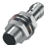
Sensor with plug connection for signal output for the PLC