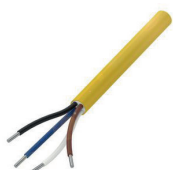
Cable between terminal strip and PLC

Normally a production machine consists of various in- and output devices such as drives, sensors, actuators or signal lamps. All these devices either generate or need signals exchanged with the central control cabinet. The control cabinet contains the PLC, the central supply voltage and, if needed, an HMI for the system. Cables carry the analog and digital signals for the in- and output devices in the field, which are directly wired to the in-and output cards in the central controller or via terminal strips.