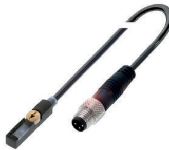
Magnetic field sensor for the T-slot for detecting the piston position on pneumatic cylinders

The magnetic field sensor detects the magnetic field strength of a permanent magnet. This also works through non-magnetic walls, such as through an aluminum cylinder. If the threshold value (magnetic field strength) is exceeded, the sensor generates a switching signal. The miniaturized electronics allows you to install these sensors directly in the C-slot (3.8 mm). Form factors for other slot types, e.g. T-slot, and for other attachment options are also available.