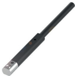
Magnetic field sensors for the C-slot for detecting the piston position on pneumatic cylinders

A magnetic field sensor integrated into the slot detects the opening condition (open/closed) of a gripper or the position of a pneumatic ejector. This allows you to ensure that blister packs are exactly positioned in boxes or that improperly packaged matches are sorted out. Magnetic field sensors feature a compact form factor and ease of installation.